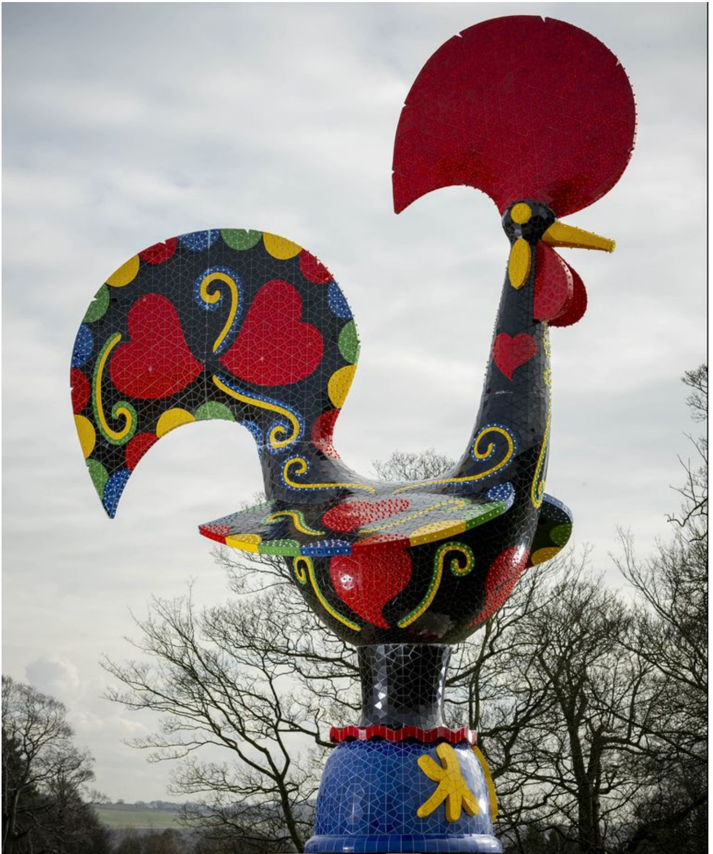
Joana Vasconcelos, Pop Galo , 2016