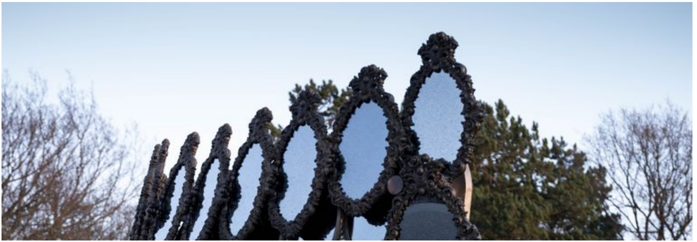
Joana Vasconcelos, I'll Be Your Mirror, 2019

Of her work, Vasconcelos has said: “You can have something really kitsch or ugly and you can transform it, and it can become really beautiful and important.”