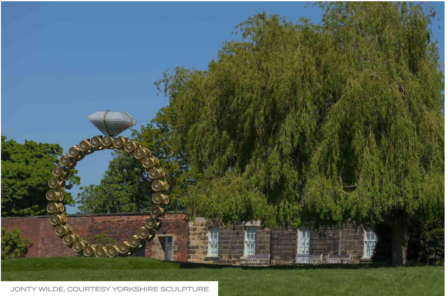
JONTY WILDE, COURTESY YORKSHIRE SCULPTURE

Although all indoor galleries are temporarily closed in line with government guidelines, sculptures in open air remain proudly on display, including six magnificent works by the Portuguese artist Joana Vasconcelos at the Yorkshire Sculpture Park.